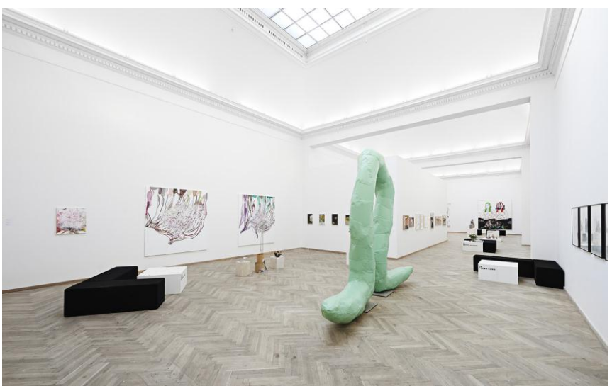
CHART ART FAIR 2015

The 4<sup>th</sup> edition of CHART ART FAIR is the most ambitious to date, with an expanded gallery list, the introduction of CHART DESIGN, and an extensive programme of talks and events.